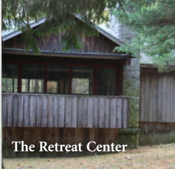
The Retreat Center