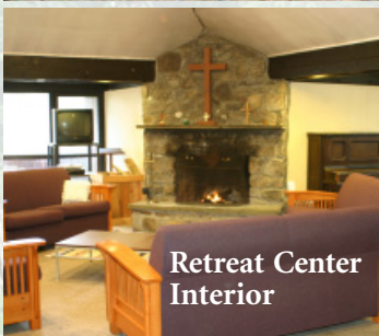
Retreat Center Interior

The Retreat Center is a one story winterized retreat lodge, the only one of our buildings that has regular (non-bunk) beds. Groups desiring non-dormitory accommodations find this building suitable for their needs. The Retreat Center accommodates a maximum of 28 people, and it is divided into two wings. Each wing includes 3 bedrooms with three twin beds in each, and a larger end room with 5 twin beds. The main core of this building has two restroom facilities, full galley kitchen with a gas stove and oven, refrigerator, microwave, and coffee maker. The kitchen is stocked with pots, pans, dishes and utensils for cooking. The main room of The Retreat Center offers a lot of seating, wrap-around windows, tables ideal for dining or projects, and a stone fireplace.